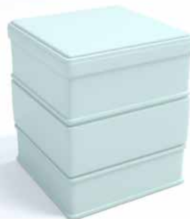
EnviroSump™ Filtration Unit