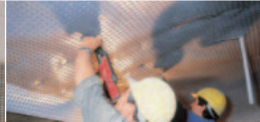
Installation is easy.