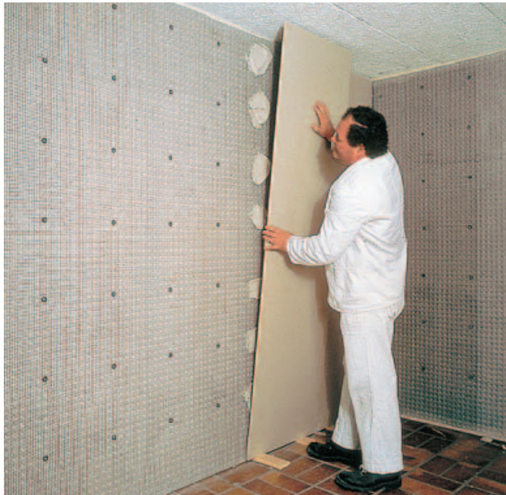
DELTA®-PT forms a waterproof, reliable support for plaster and render coats or plasterboard panels.